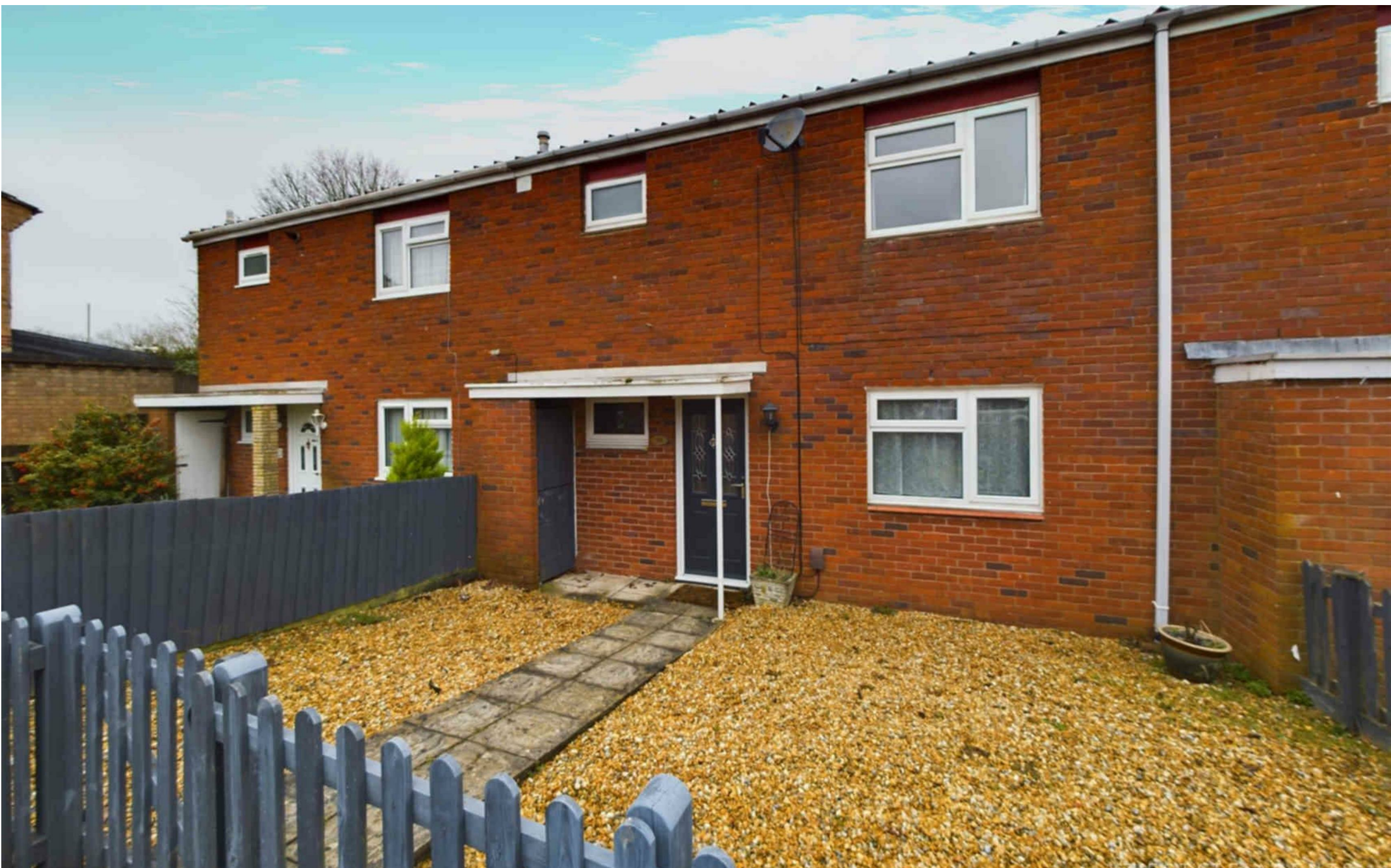
Mozart Close, Brighton Hill, Basingstoke, RG22 4HZ